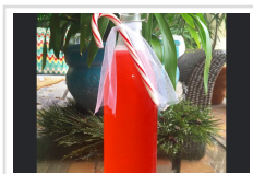
Candy Cane Vodka

Tags: boca raton, capital grille, cocktails, delray beach, drinking, fort lauderdale, obo, obo restaurant, palm beach, palm beach gardens, palm sugar, salt 7, salt7, south florida, sweetwater bar and grill, sweetwater boynton beach, tap 42, tap42, tax season, taxes, tiki ono, west palm beach