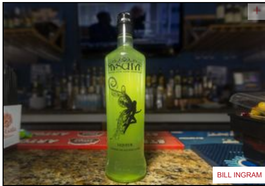
View of a 70 proof liter bottle of Myschyf Liqueur.