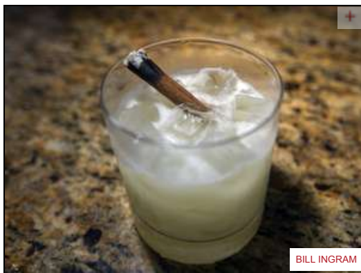
View of a drink called "Getting into ...." made with 70 proof Myschyf Liqueur at Benny's on the Beach in Lake ... Read More

"I pulled these hemp seeds out of my bag - they have tons of protein and Omega 3. They're so small but have all this flavor," remembers Hagan.